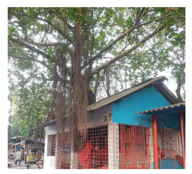
Fig 8. Conservation of Ficus benghalensis L. (Banyan) in Haldia

In Raghunathpur, Baguiati, Kolkata two species viz. Ficus benghalensis L. (Banyan) and Ficus religiosa L. (Peepal) happen to grow so close together that it is impossible to separate the two. Both these tree species are conserved together (Fig. 7). The Banyan tree, Ficus benghalensis L. is seen as Lord Shiva, a Hindu deity by the local people. The other tree, Ficus religiosa L. or the Peepal tree is seen as Lord Vishnu and goddess Laxmi. Though daily worship is done Monday there is a special worship for lord Shiva and on Saturdays the worship is for Laxmi Narayan puja. Marble has been used to form a permanent structure around the trees.