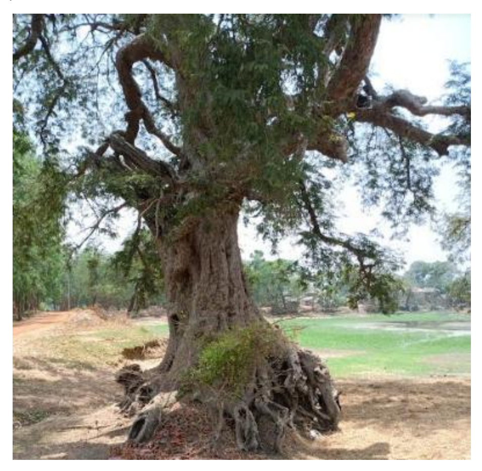
Fig 3. The tamarind tree, Tamarindus indica L. that is worshipped.

according to the local people, as the space is associated with the Kali worship the tree is automatically conserved.