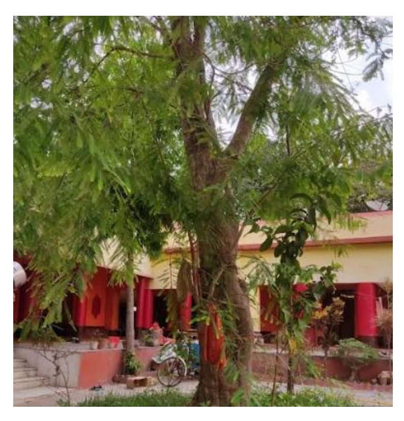
Fig 5 'Amar gaach' the gooseberry tree ( Embilica officinalis Gaertn) in Arjunpur, Baguiati, Kolkata that is believed to be 100 years old.

The myth associated with this particular Indian gooseberry tree in Arjunpur, Baguiati, Kolkata is that it is believed to be more than 100 years old. The local people considered the tree as 'Amar Gach' so they worship the tree daily (Fig. 5). Many people tie sacred thread around the branches of this tree and pray so that their heart's desires are fulfilled.