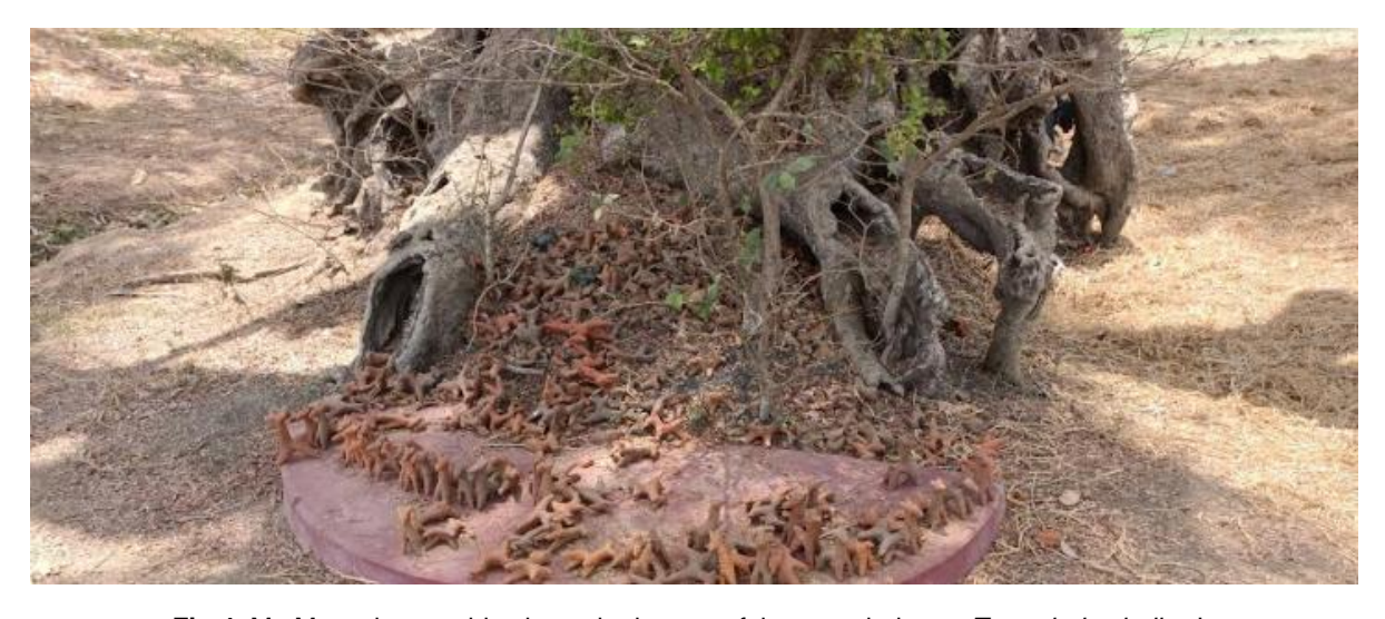
Fig 4. Ma Manasha worship site at the bottom of the tamarind tree, Tamarindus indica L.

The deity associated with this tree in Chandipur village in Bankura is Maa Manasa, the Hindu goddess of snakes and poison. Worship is done by the local people only on a special day during the rainy season. In this site the place of worship is cemented at the bottom of the tree which seems to be the only indication of worship (Fig. 3 & 4). As the worship is an annual affair it could be a reason why no other concrete structure is associated with this plant or the fact that it is a rural area the place of worship remains discreet.