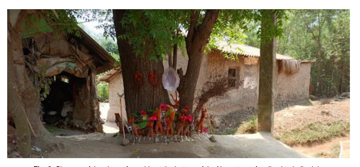
Fig. 2 . Close up of the place of worship at the bottom of the Neem tree, Azadirachta indica L in Madhurpur, Bankura.

The neem tree is an important medicinal plant. In the village Madhurpur, Bankura the Hindu goddess Kali is worshipped at the foot of this Azadirachta indica A. Juss. (Fig 1 & 2). The height of the tree is medium. The local people reported that worship was done on a monthly basis on the day of 'Amavasya' or the New Moon day in Hindu calendar. On the occasion of Kali Puja following Durga Puja in autumn the scale of the worship is notched up. The worship becomes quite flamboyant