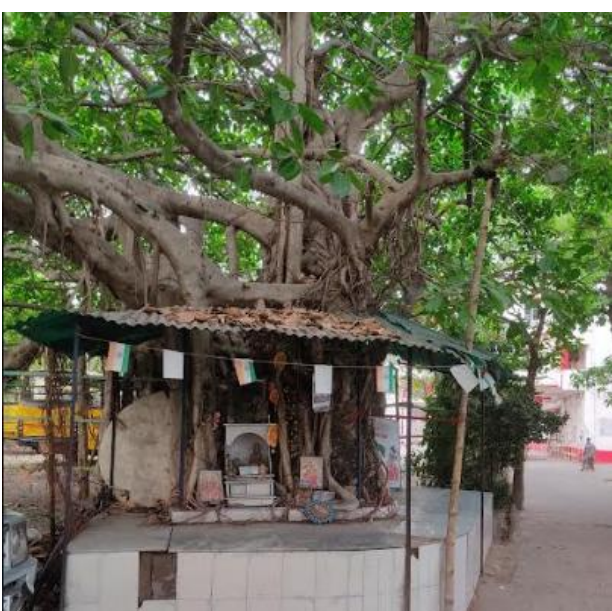
Fig 7 . Conservation of two species viz. Ficus benghalensis L. (Banyan) and Ficus religiosa L. (Peepal) in Raghunathpur, Baguiati.

The holy basil or Ocimum tenuiflorum L. is a common plant that is conserved in many Hindu households (Fig. 6). It is also a common medicinal plant used to cure common cough and cold. Ocimum tenuiflorum L. is seen as the embodiment of goddess Tulsi. This plant is worshipped and watered daily as part of the daily Hindu household ritual. This plant is more often found in the courtyard of households. Very often the area around the plant is cemented with space in the middle to contain soil for Ocimum tenuiflorum L. to grow. So these religious acts ensure that this plant is conserved.