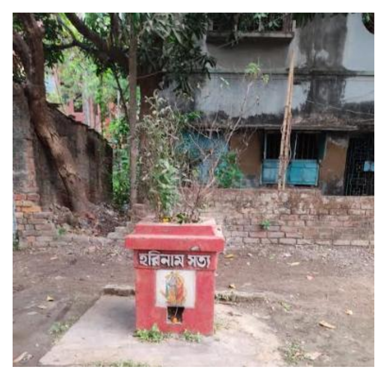
Fig 6. The holy basil or Ocimum tenuiflorum L. is conserved in many Hindu households.

The myth associated with this particular Indian gooseberry tree in Arjunpur, Baguiati, Kolkata is that it is believed to be more than 100 years old. The local people considered the tree as 'Amar Gach' so they worship the tree daily (Fig. 5). Many people tie sacred thread around the branches of this tree and pray so that their heart's desires are fulfilled.