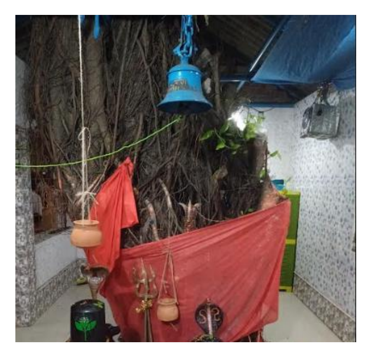
Fig 9. Close up view of the worship site of Ficus benghalensis L. (Banyan) in Haldia.

An entire temple has been constructed around the trunk of the Ficus benghalensis L., banyan tree in Haldia (Fig. 8). The structure is a room with doors and windows which has been built with the trunk of the banyan tree in the centre. The Hindu god Shiva is worshipped on a daily, both morning and evening at this sacred site. During the month of Sharavan in the Hindu calendar, that falls in the rainy season special worship is done on Mondays. Idols have been placed near the trunk for worship (Fig. 9).