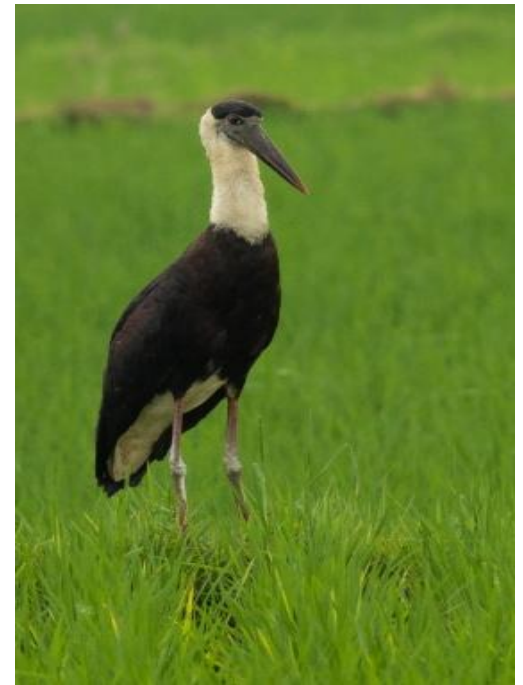
Fig. 6 Wooly Necked Stork

of IUCN. Some photographs of the birds are given in Fig 6-13.