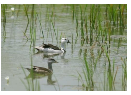
Fig. 9. Cotton Pygmy Goose