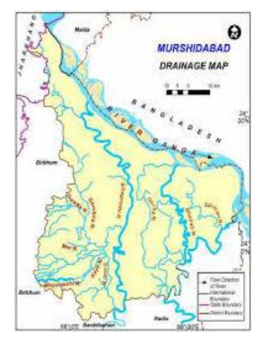
Fig. 2. Map of Murshidabad district with the main rivers