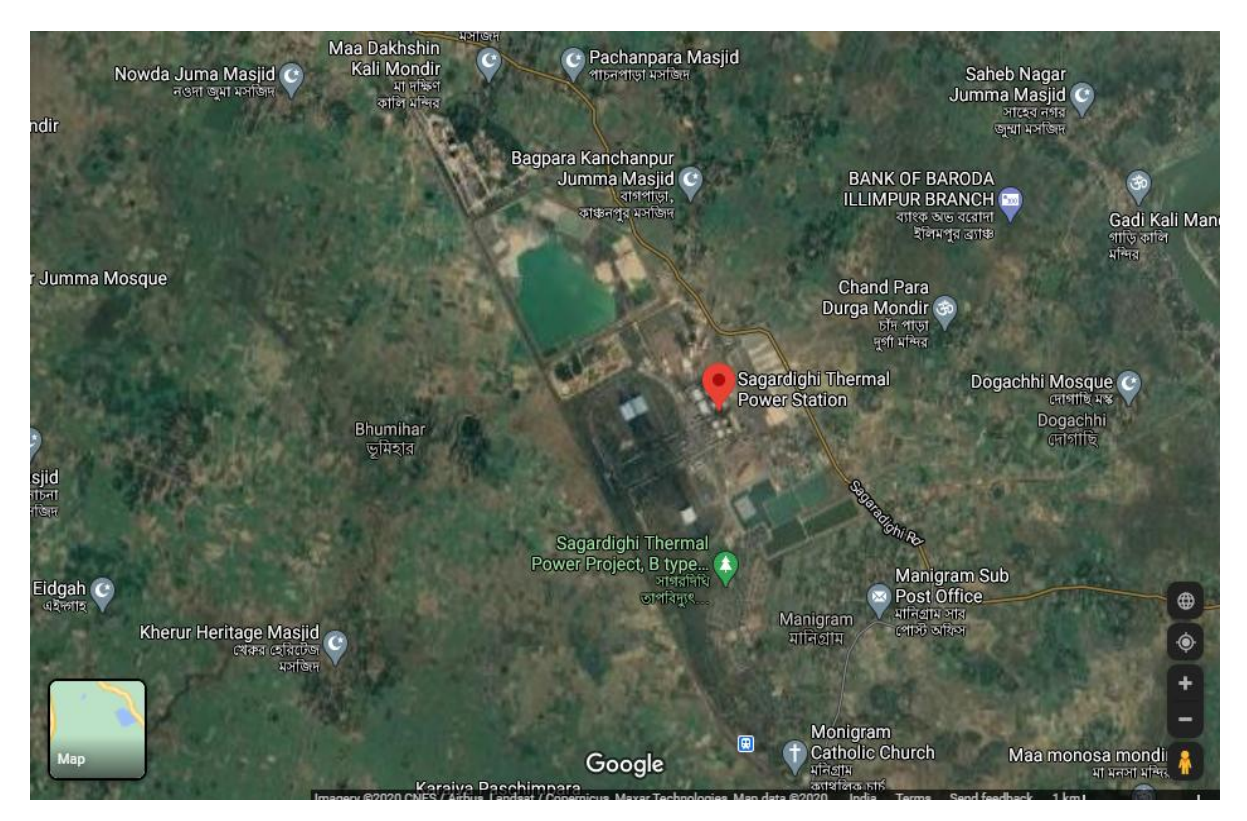
Fig. 4. Google Earth image of the Ash Pond of the Sagardighi Thermal Power Plant, Murshidabad.