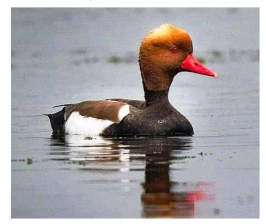
Fig. 12. Red Crested Poachard