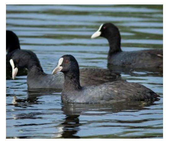
Fig. 10. Eurasian Coot