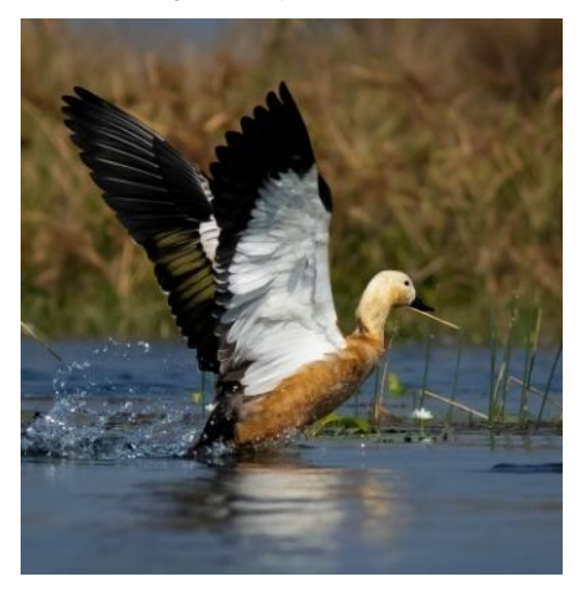
Fig. 7. Rudy Shell Duck