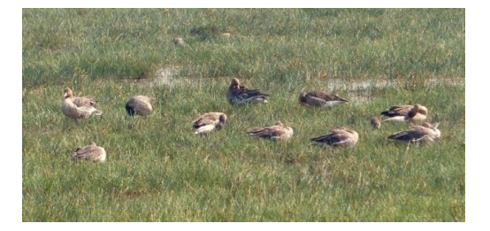
Fig. 13. Grey Leg Goose