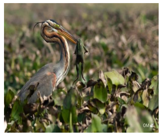
Fig. 11. Purple Heron