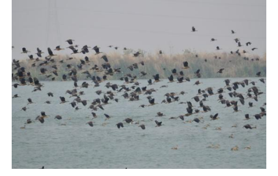
Fig. 8. Lesser Whistling Duck